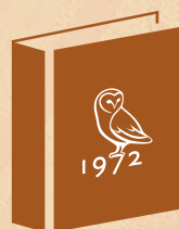
4. Classic 210 x 235mm