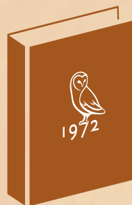
2. Portrait 300 x 235mm