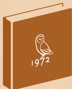
1. Large 300 x 300mm