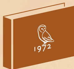
3. Landscape 235 x 300mm